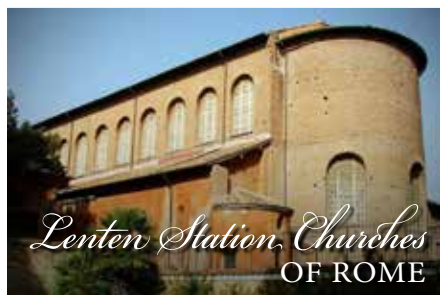
Lenten Station Churches OF ROME