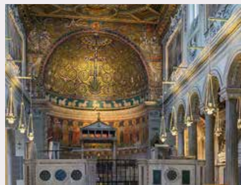
Basilica of St. Clement in Rome, Italy

Christians today continue to observe the early custom of visiting these churches in Rome. At the Pontifical North American College (the U.S. seminary in Rome), priests and seminarians have enjoyed the tradition of gathering each morning at 7 a.m. for Mass at each of the station churches. Their prayers echo the voices of centuries of Christian pilgrims who, like themselves, came to the tombs of the martyrs to honor those saints whose lives bore witness to Christ and whose blood consecrated the Eternal City.