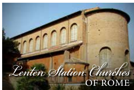
Lenten Station Churches OF ROME