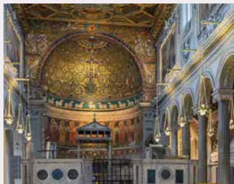
Basilica of St. Clement in Rome, Italy

While we may not be able to travel to Rome this Lent, we can still take part in this pilgrimage. Along with our prayer and penitence during Lent, the observance of the station churches affords us a unique opportunity to make a true pilgrimage of faith. For this reason, the Station Churches will be listed in the left column of page 4 of The Cathedral Courier throughout Lent. We encourage everyone to take note of the Station Church for each day in Lent and perhaps find out more about that particular church. There is a wealth of knowledge about these particular churches available on the internet. Several articles and books have been published on this pious practice as well, in particular the fantastic book by George Weigel and Elizabeth Lev titled Roman Pilgrimage: The Station Churches .