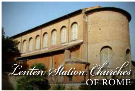
Lenten Station Churches OF ROME