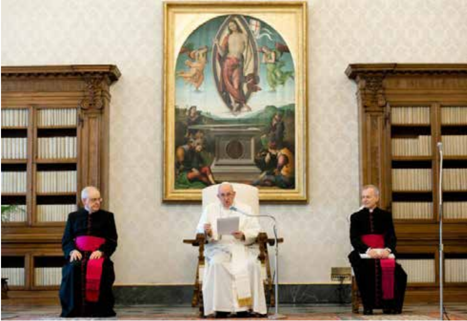
Pope Francis speaks during his weekly general audience in the library of the Apostolic Palace at the Vatican June 3, 2020. During the audience, the pope prayed for George Floyd and said, "We cannot tolerate or turn a blind eye to racism."

VATICAN CITY (CNS) -- In the story of the patriarch Abraham -- honored by Jews, Christians and Muslims -- faith becomes a direct relationship with God that is marked by constant prayer, which sometimes takes the form of "debating" with God, Pope Francis said.