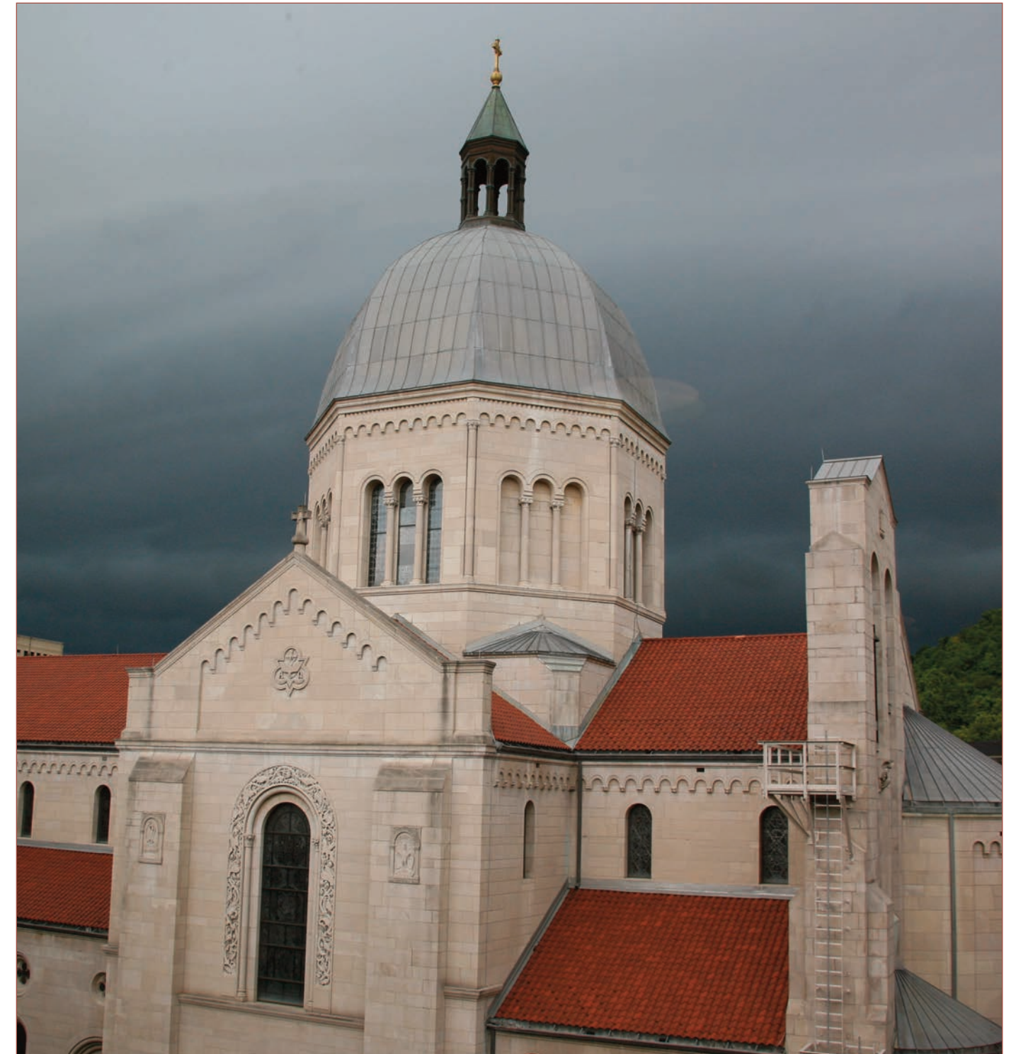
The warmer, humid temperatures of the season always bring the chance for severe weather. Here is a photo I took of our Cathedral as storms rolled in June 16. Just wanted to share it with you!

Weekly Journal for the Cathedral of St. Joseph