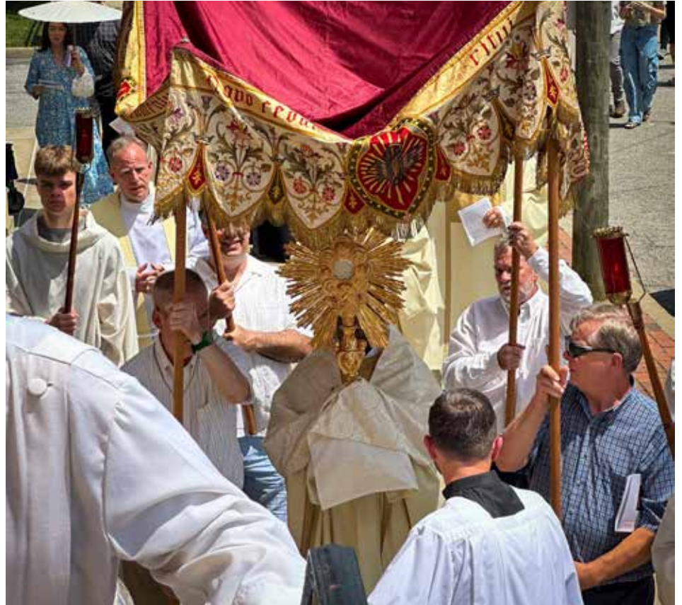
The Eucharistic Procession approaches the front of St. Alphonsus Church where the celebration ended with Benediction followed by a luncheon in the parish hall.

We are deeply grateful to all who joined us, especially the altar servers, musicians, volunteers, and parishioners for