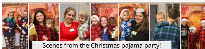
Scenes from the Christmas pajama party!