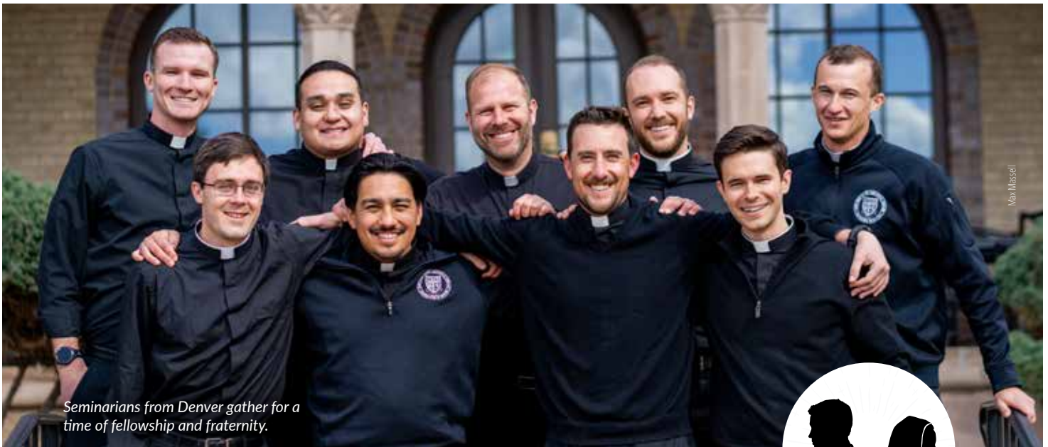
Seminarians from Denver gather for a time of fellowship and fraternity.